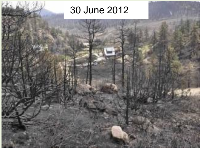
30 June 2012