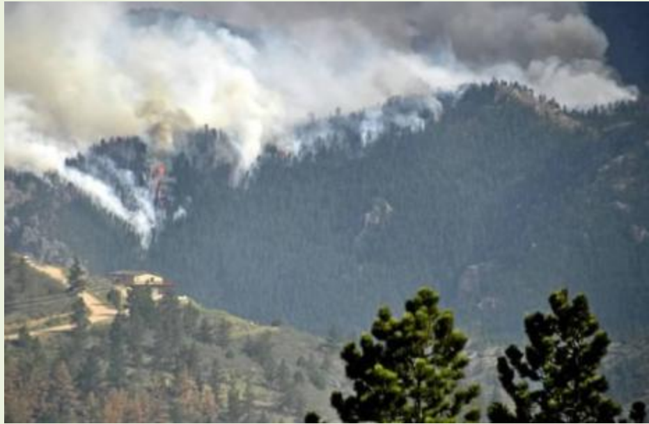
High Park Fire – 13 June 2012