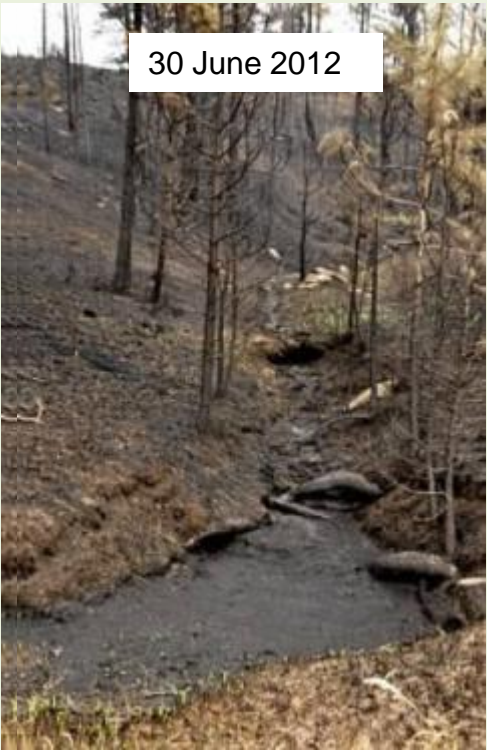
30 June 2012