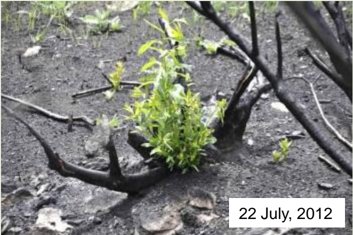
22 July, 2012