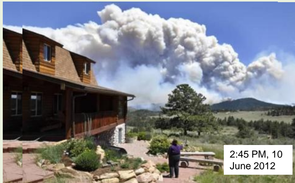
2:45 PM, 10 June 2012