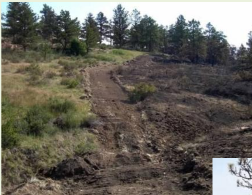
The fire line that helped to protect the Harmon's house and much of the 9 th Filing