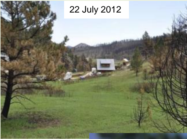
22 July 2012