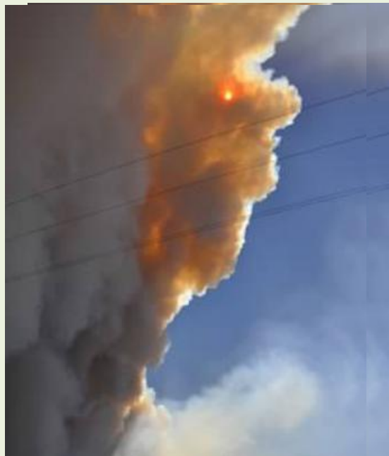
Smoke obscures sun, 10 June 2012