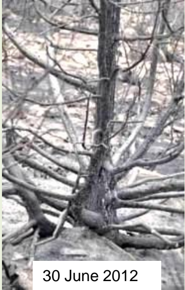
30 June 2012