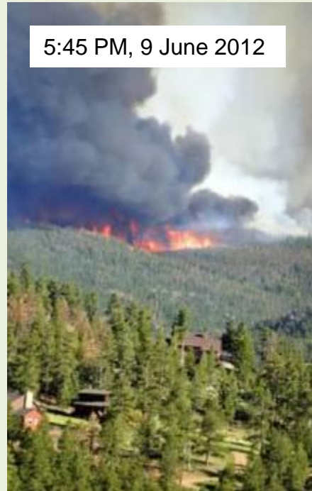
5:45 PM, 9 June 2012