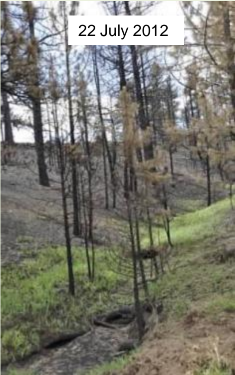
22 July 2012