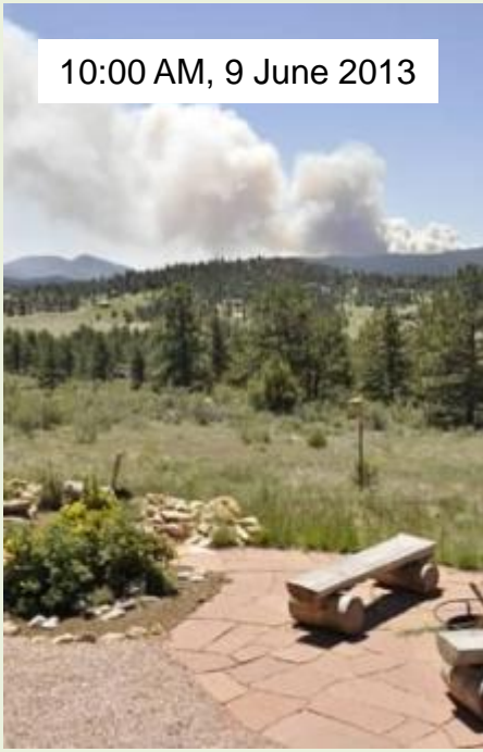
10:00 AM, 9 June 2013