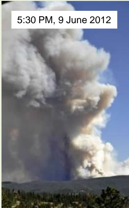
5:30 PM, 9 June 2012